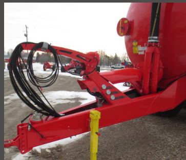
WEIGHT TRANSFER KIT Optional