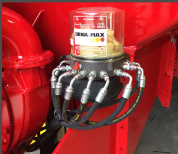
AUTO GREASE SYSTEM Optional