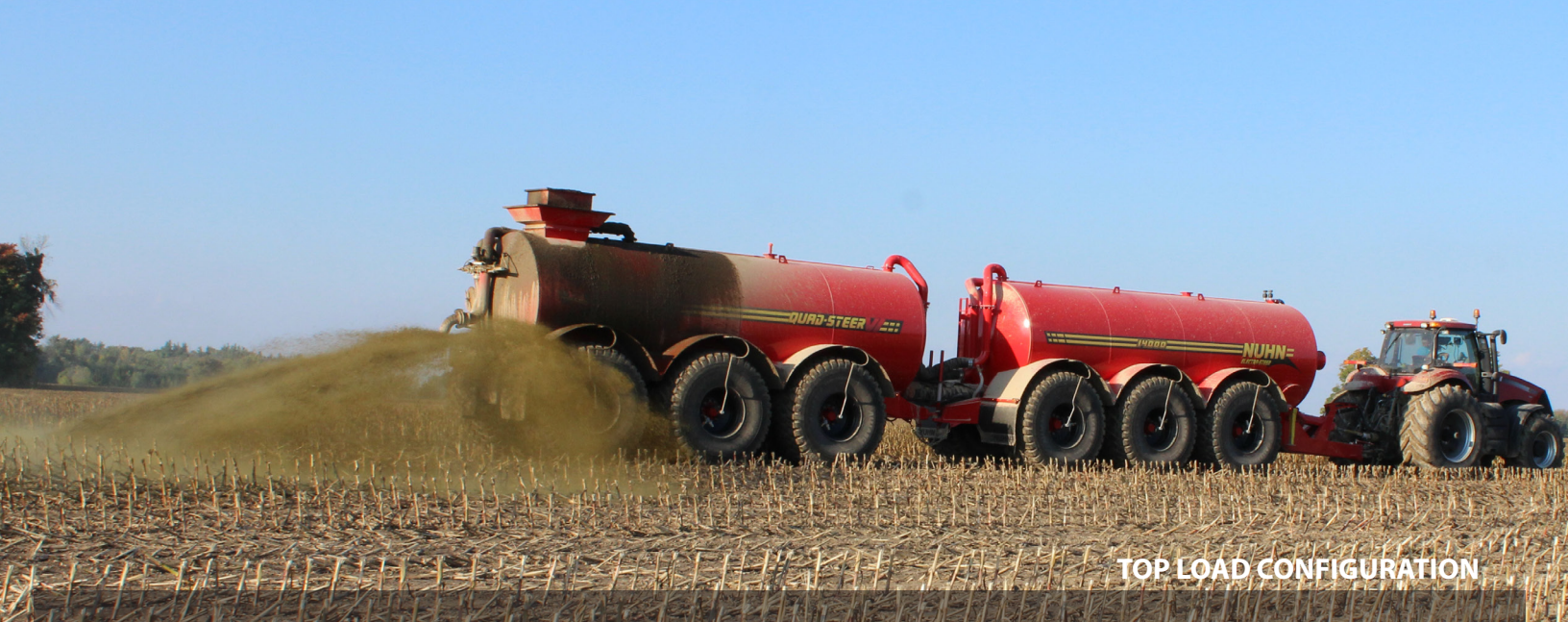
TOP LOAD CONFIGURATION

The Quad-Steer articulating tank with tri-axle electronic steering will allow for easy turning with minimal ground disturbance. Drum brakes on all tires are standard.