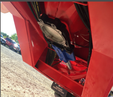
HYDRAULIC ROCK TRAP

The Nuhn Electra-Steer is engineered to steer the tank the exact angle when making a turn, and even steers while backing up!